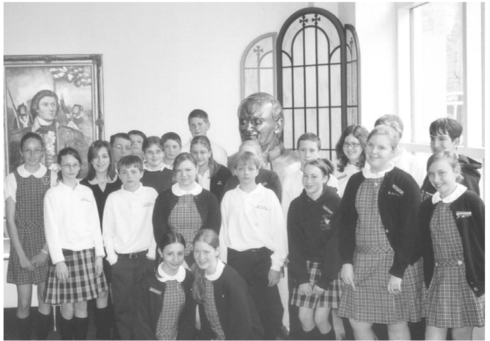
Students and teachers from Pope John Paul II Regional Catholic School in Bridesburg.