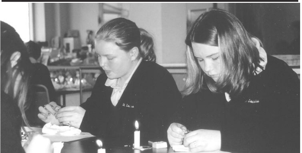
Students and teachers from St Laurentius School in Fishtown.

This event received television coverage on TV 3, 6 and 10, as well as local newspapers. You can find information about Pisanki, Swieconka and other Polish Customs on the Museum's Internet site at: PolishAmericanCenter.org.