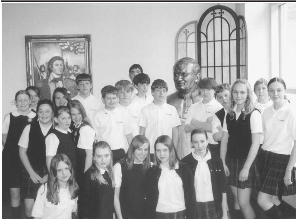
Students and teachers from St Adalbert School in Port Richmond.

The pisanki derive from an ancient tradition when eggs, the symbol of life, were endowed with magical properties and were thought to ensure both a plentiful harvest and good health. This practice of coloring Easter eggs is very much alive in Poland today as well as enjoyed by Polish people all over the world. There are several techniques for making pisanki including the use of wax flowing from a pipe or funnel, producing richly ornamented designs or the etching of designs onto a previously colored egg. The geometric and floral patterns or the animal and human images produced reveal a high level of craftsmanship and artistry.