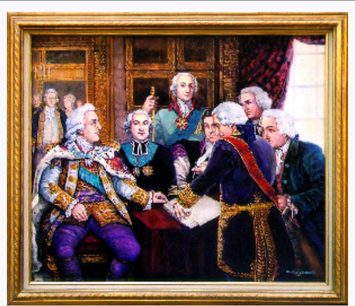
Poland's Constitution - Second Oldest Democratic Constitution in the World Drafted in 1788 - Enacted on May 3, 1791

Greetings to Polonia in Philadelphia and the Tri-State Area from the