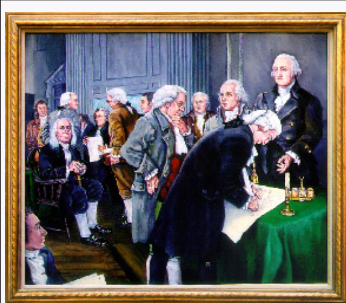
United States Constitution - First Democratic Constitution in the World Drafted on September 17, 1787 - Ratified in 1789

"All authority in human society takes its beginning in the will of the people." (Polish Constitution of May 3, 1791)