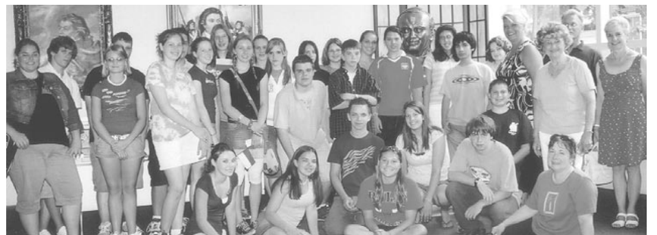
Polish Women's Alliance of America Youth Group visits the Polish American Cultural Center Museum on Thursday, July 13, 2006. They represent several states of the organization which is headquartered in Chicago, Illinois.