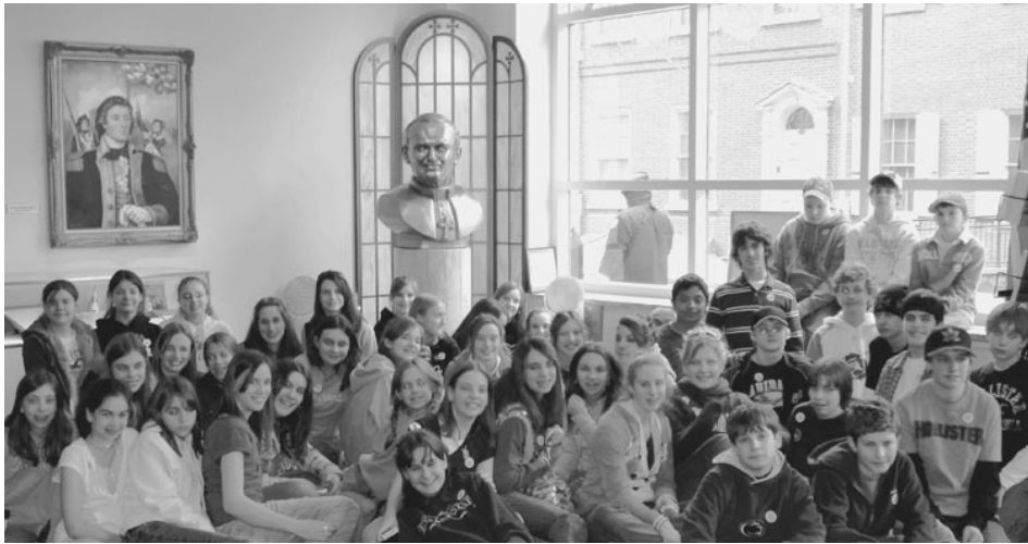
Students from DuBois Central Catholic Middle School