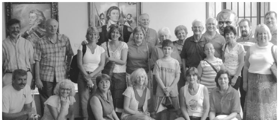
Representatives of the Polish Arts Club of Trenton, New Jersey.