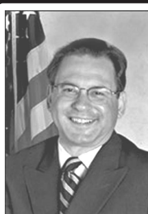
Councilman William Greenlee Council-At-Large, City of Philadelphia

In appreciation for your positive contribution to the City of Philadelphia and in recognition of this festive occasion of Polish American Heritage Month and the Pulaski Day Observance. I wish you continued success. Sto Lat!